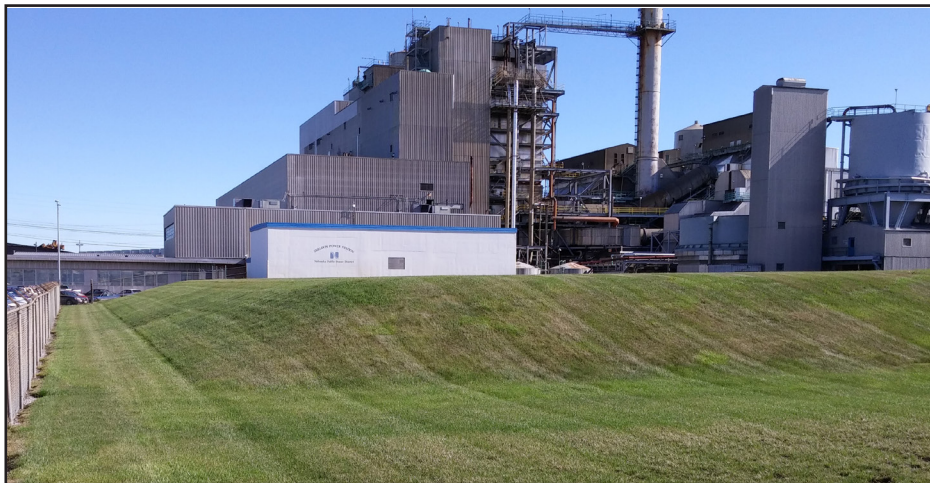
White building is Intermediate Heat Exchanger Building; grassy area covers the belowground portion of the decommissioned reactor facility

In 1997, DOE began collecting groundwater samples annually from 17 monitoring wells as a best management practice, assuring stakeholders no groundwater contamination was occurring. In 2008, sampling frequency changed from annual to once every two years. No radioactivity has been detected above background levels in any samples collected to date, and there is no evidence that the reactor facility has had any effect on site soil or groundwater. Following the 2016 sampling event, DOE has further reduced the sampling frequency to once every five years for the next 20 years (2021 through 2041), then once every 10 years from 2041 through 2071. It is estimated that by 2071 groundwater monitoring requirements will no longer be warranted and monitoring will be discontinued. Additionally, a total uranium analysis will be included in future sampling events so uranium results can be compared with the gross alpha results and the relationship between the two types of samples can be evaluated.