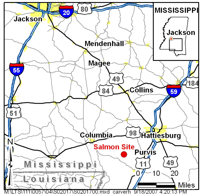
Location of the Salmon, Mississippi, Site

Projects Salmon and Sterling were designed to evaluate the country's ability to effectively interpret seismic signals from detonations in a salt medium (the Tatum Salt Dome). This was important in determining our ability to recognize if the testing treaty was being followed. The Salmon and Sterling tests were the second and fourth nuclear tests in the program. The Salmon test took place on October 22, 1964, at a depth of 2,700 feet below ground surface, which is approximately